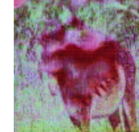
P_{0.5}(w) \rightarrow Q_8(w, f)