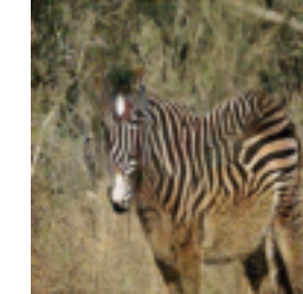
Q_{12}(w, f) \rightarrow P_{0.5}(w, f)